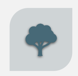
DESTRUCTION OF ECOSYSTEMS