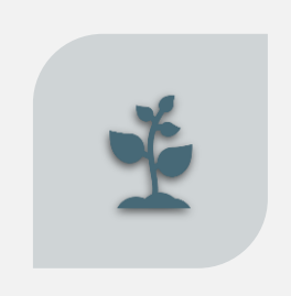
AIR, SOIL AND WATER POLLUTION