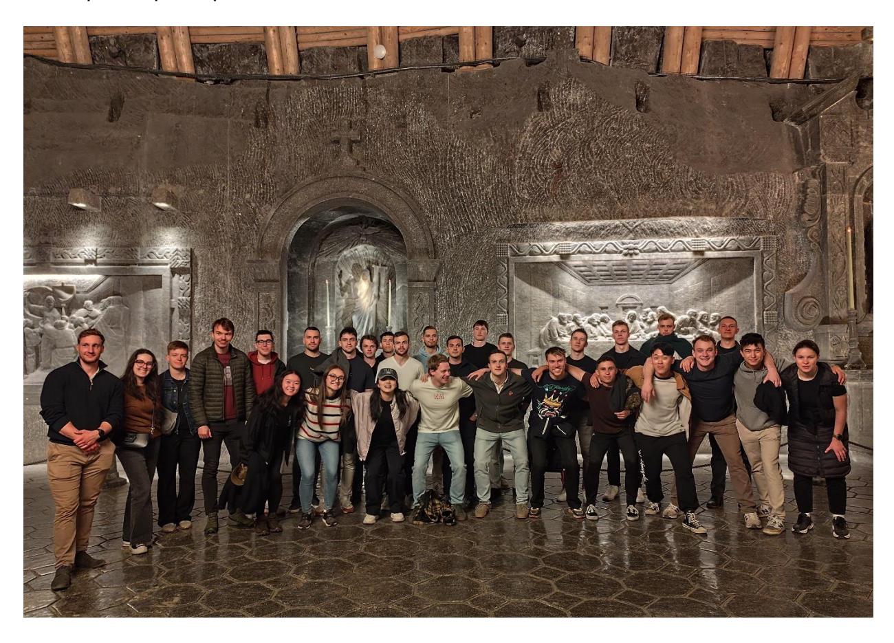
Picture 2: Group photo in the Wieliczka Salt Mine

The trip included visiting the Wieliczka Salt Mine and the most important sights and monuments of Kraków, such as: the Dragon of the Wawel Hill, the Wawel Royal Castle, the Wawel Royal Cathedral, the Church of St. Andrew, the Bishop's Palace, the Cloth Hall, the Town Hall Tower, St. Mary's Basilica, and the Church of St. Adalbert. On the last day of the trip, the participants visited the Srebrna Góra Fortress.