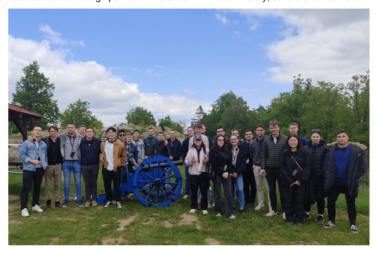
Picture 5: Participants in the the Srebrna Góra Fortress

Study visits are carried out as part of the Cultural Program, which is organized by the Career and Erasmus Programme Office. The aim of the Program is to familiarize cadets and students from foreign partner universities with Polish history, culture and traditions.