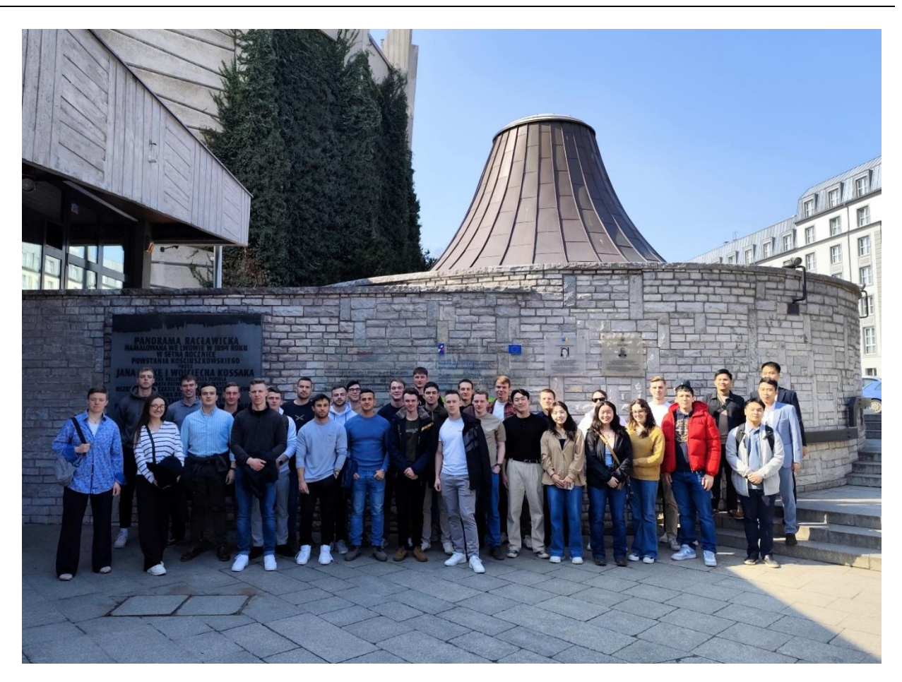
Picture 4: Participants of the study visit in front of the Panorama.

The participants were able to see among others: the St. John the Baptist Archcathedral, Collegiate Church of the Holy Cross and St. Bartholomew, the Monument of St. John of Nepomuk, the Tumski Bridge, Stare Jatki Street, the Monument in Honor of Slaghter Animals, St. Elizabeth's Church, the City Square, Town Halls, Plac Solny (Salt Market Square), the Pillory.