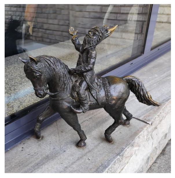
Picture 1: Dwarf of Wrocław inspired by Gen. Kościuszko.

On 25 March 2025, students and cadets participating in the International Semester 2025 together with officers from Vietnam, who are attending the English Language Course by the Foreign organised Languages Department of the Military University of Land Forces, visited the famous Panorama of the Battle of Racławice and were taken for a sightseeing tour of Wrocław. The Panorama of the Battle of Racławice - it is a painting by Jan STYKA and Wojciech KOSSAK dated from 1893-1894, commemorating the 100<sup>th</sup> anniversary of the Kościuszko Insurrection the victorious battle of Racławice on 04 April 1794, fought by the insurgents led by General Tadeusz Kościuszko against the invading Russian troops.