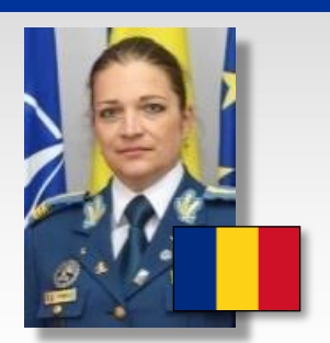
EMILYO Vice-Chair Logistics & EUAFA- Coordinator RO/HCAFA