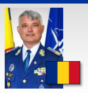
EMILYO Air Defence Semester)