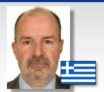
EMILYO Chair LoD-12 (International Air Force Semester)