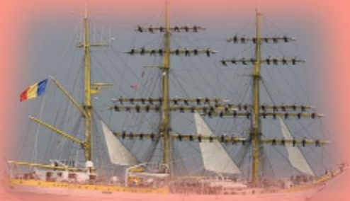
Training Ship Squadron