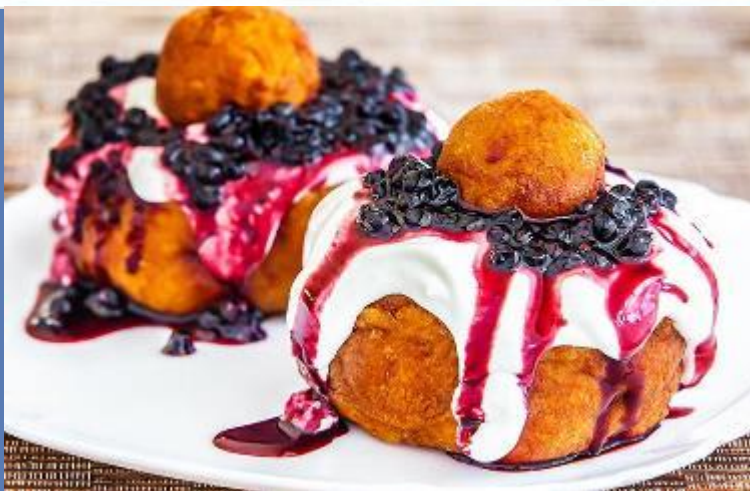
Papanasi with sour cream and jam