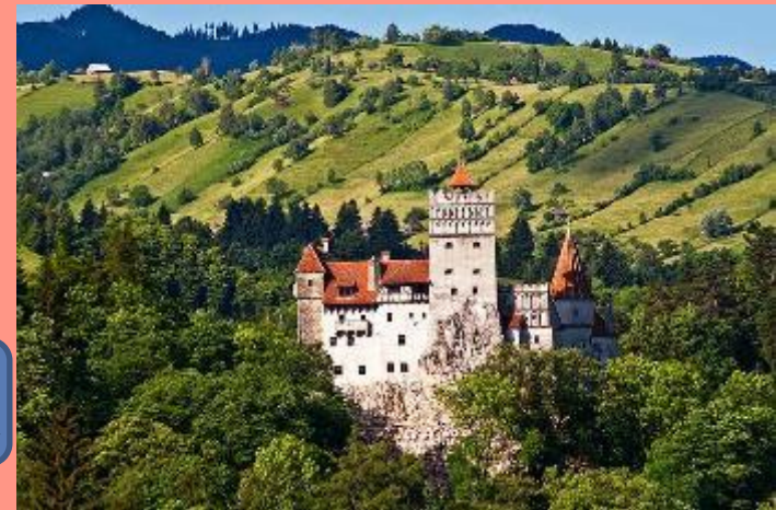
Bran - The Dracula's Castle