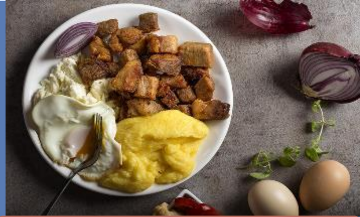
Tochitura moldoveneasca (Moldavian Stew)