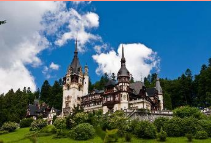
Peles - the Ex Royal Castle