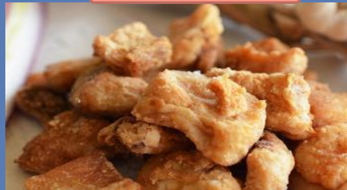
Jumari (Smoked bacon and greaves)