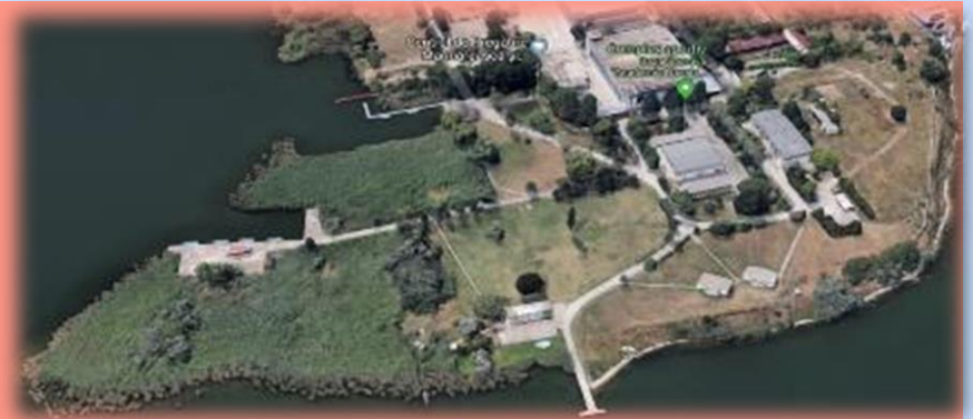
Seamanship and Nautical Sports Center - Palazu Mare