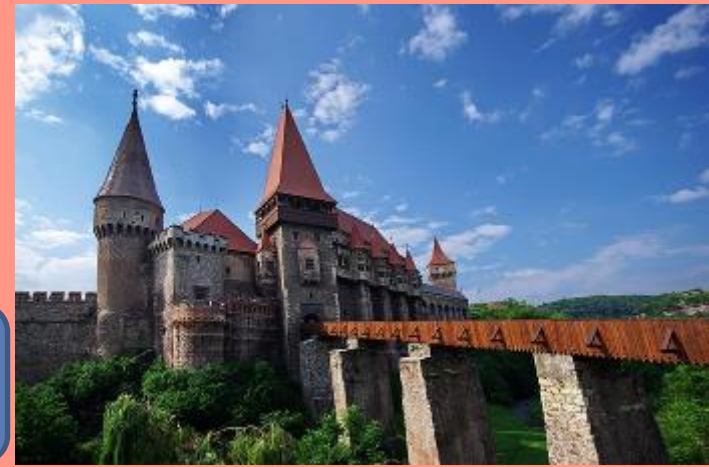
Hunedoara - The Castle of the Corvinus family