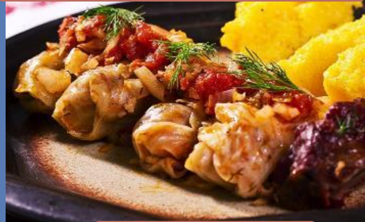
Sarmale (Cabbage Rolls)