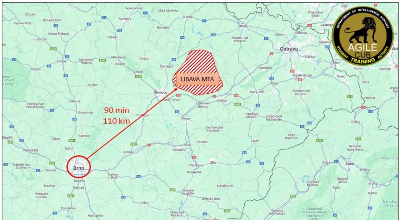
Map 2 – Distance and travel time from Brno to Libava MTA