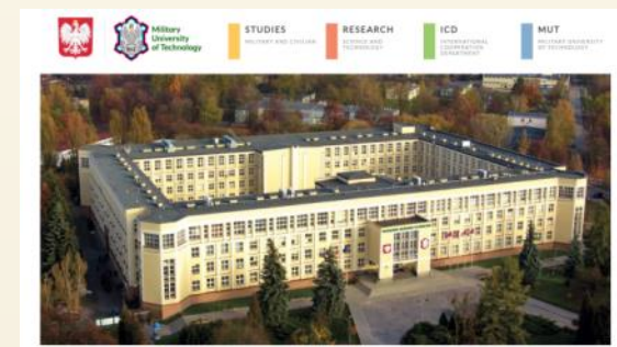
MUT Warsaw (PL)