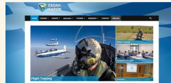
HAFA Athens (GR)