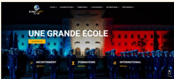
Fafa Salon de Provence (FR)