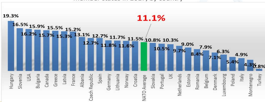
Figure 1: Women Active Duty military personnel in the armed forces of NATO member states in 2017, by country