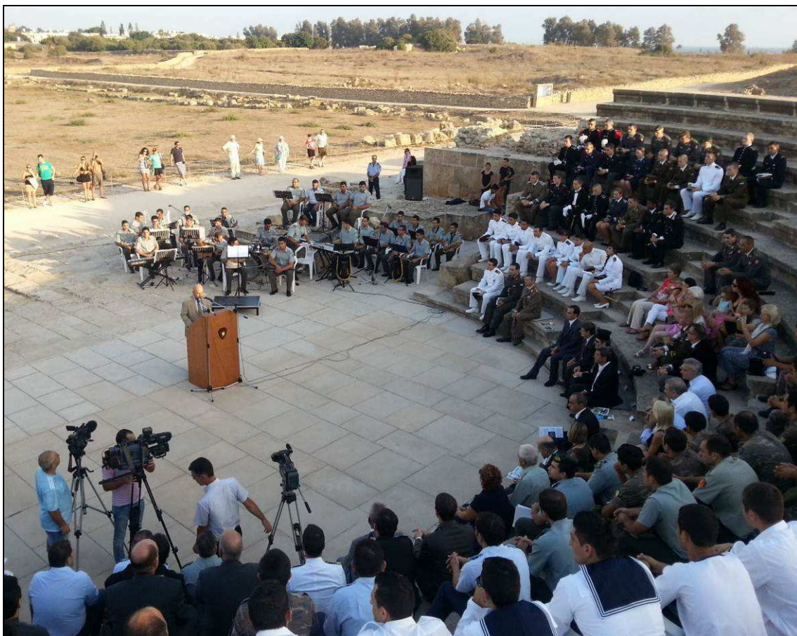
Opening ceremony of the CSDP-Olympiad in Paphos/Cyprus.

An impressive opening ceremony took place in the very nice and historical interesting Odeon in Paphos under the auspices of the Cypriot Minister of Defence, Demetris ELIADES. It gave a first impression on the great hospitality of Cyprus which lasted until departure.