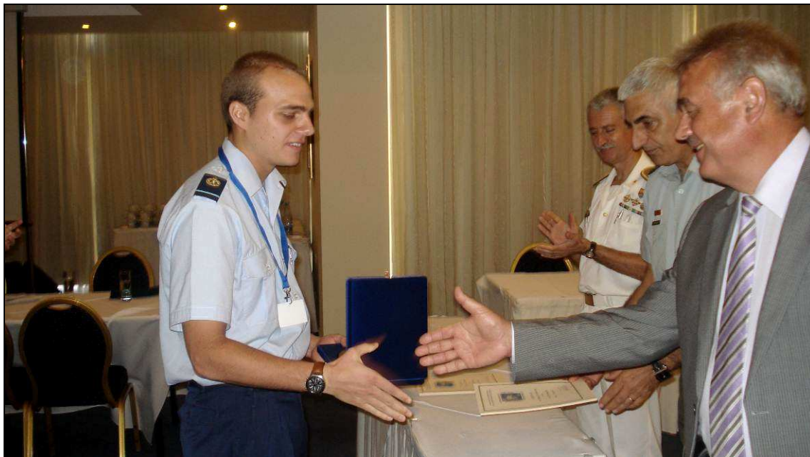
Head of ESDC congratulating the Belgian winner of the single competition.