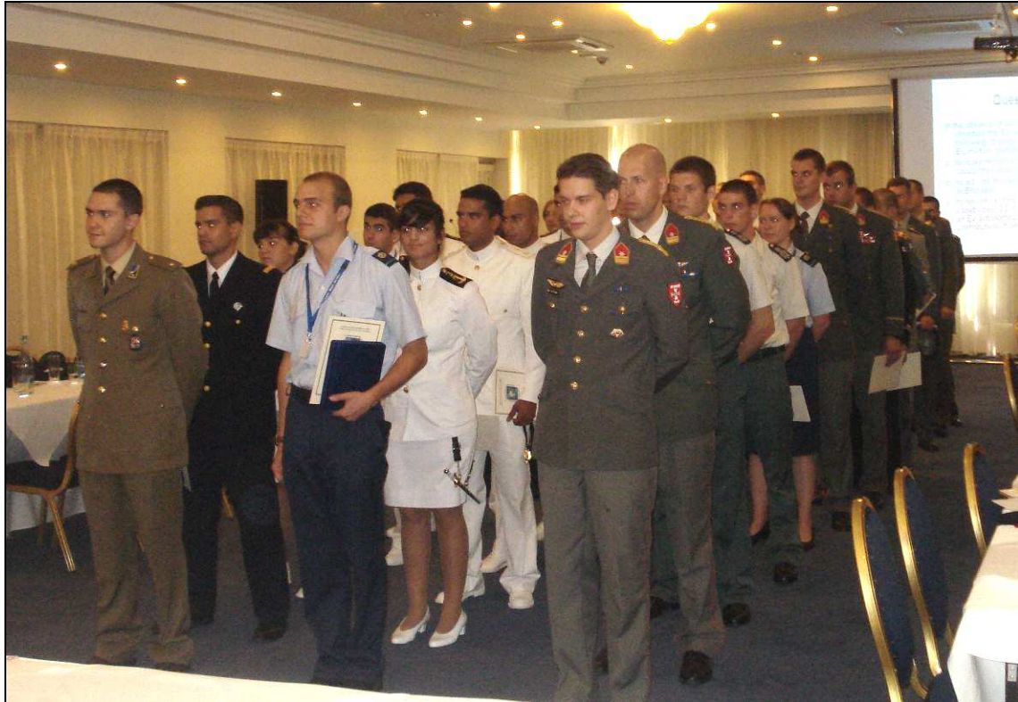
CSDP-Olympiad participants during the final ceremony.

The whole Olympiad ended with a farewell lunch and an exchange of information between the participants. Most of them profited from this friendly competition not only concerning an increase of knowledge but also in creating new friendships and networks.