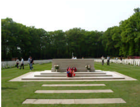
The Airborne War Cemetery