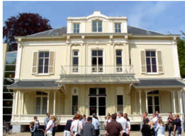
The HQ today