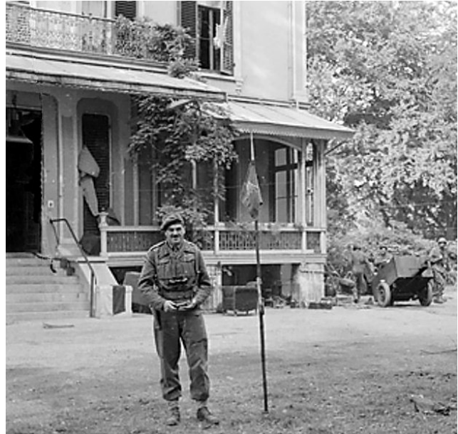
MajGen Urquhart in front of his HQ

Remarkable is how the week was organized: Each and every activity was planned and conducted by a Dutch cadet – and all of them performed outstandingly.