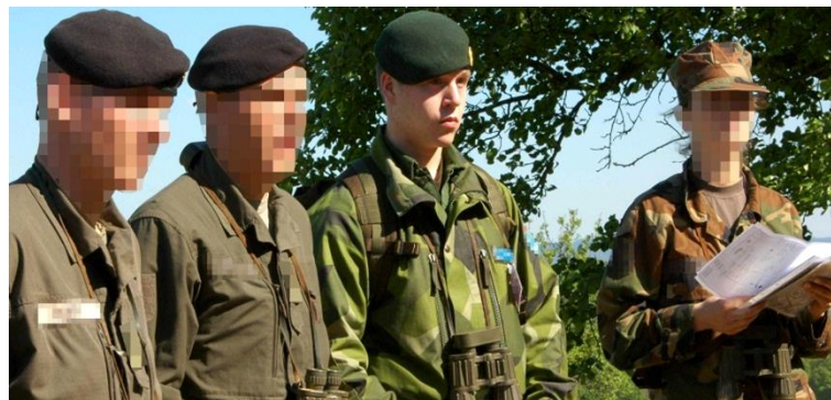
Figure 1: National and international Officer Cadets during the leadership training Crisis Management Operations. 4

The essay text following the description is to be separated from it by pressing the enter key once. Example: